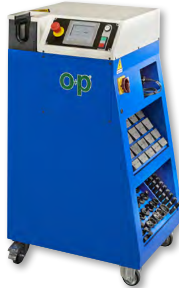
37° FLARING TOOLS: THEY ARE SUPPLIED ACCORDING TO UNI ISO 8434-2 AND DIN 3949.

UNISPEED USFL/01 ES is the new machine for DIN2353 cutting rings preassembling and 37° JIC rigid tubes flaring up to 42 mm diameter and 4 mm thickness. Thanks to the new electronic control with color display and touch screen, the machine enables an automatic identification of the tool into the machine and an automatic pressure setting for DIN2353 cutting rings preassembly and 37° JIC flaring, thus ensuring enhanced performances. This makes the USFL/01 ES particularly suitable for series production. It is possible to manually store recipes that are automatically recalled thanks to the automatic identification of the standard tools introduced into the machine. The machine is equipped with a tool-holder compartment.